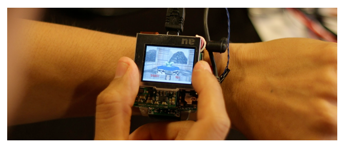
Figure 9. Doom running on our smartwatch prototype.

are not 100% effective, and also increase cost and complexity in manufacturing. One possible alternative is to use strain gauges, force sensitive resistors, and similar sensors, which measure the same forces we employ, but with essentially zero mechanical displacement. This would allow tighter integration at the expense of tactile feedback (e.g., twist would really only be torque).