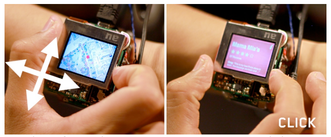
Figure 3. Panning the watch moves the map, twisting zooms in and out, and clicking shows details.

Utilizing the watchband or the bezel for input is another popular technique, as it minimizes screen occlusion. WatchIt [18] instrumented the watchband itself to act as a simple slider or button input. Ashbrook et al. [1] proposed using a capacitive bezel around the screen as an additional input channel. Blasko et al. [3] used raised, touch-sensitive segments around the bezel to enable strokes and taps. Pasquero et al. [17] combined a rotatable bezel and touchscreen with haptic feedback to create an eyes-free watch interface. Although these techniques mitigate occlusion, they may require larger surface areas to operate effectively, and generally only offer 1D radial input. In contrast, our approach uses hall-effect sensors operating behind the watchface and provides three or more analog degrees of freedom.