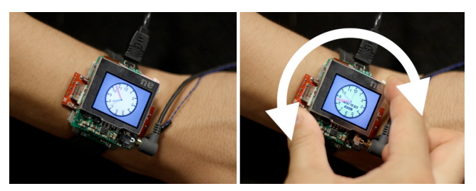
Figure 4. Clicking and then twisting sets the alarm time.

Many applications require only a single degree of freedom for navigation, coupled with a binary click for action or selection. For example, we created a clock application that displays the current time (Figure 4). When the watch face is depressed (i.e., clicked), the clock switches mode, allowing the user to set an alarm time. Twisting the watch clockwise and counterclockwise adjusts the alarm time. As our prototype provides analog twist, the application offers ratecontrolled movement, allowing for rapid and precise time